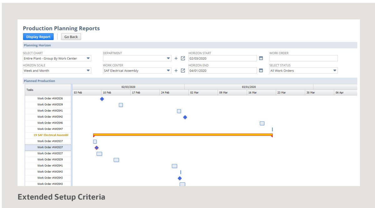
Extended Setup Criteria

You can seamlessly upgrade from one edition to another.